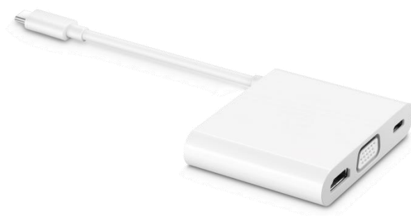
HUAWEI Bluetooth Mouse (optional):