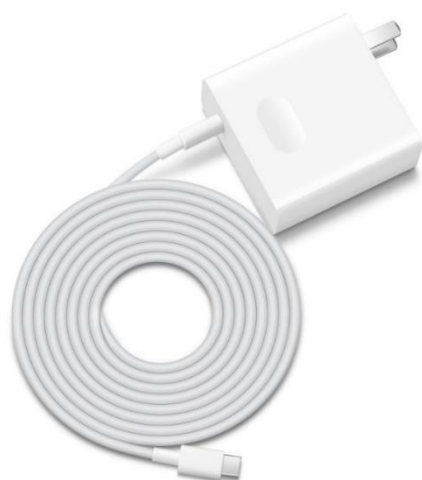
HUAWEI MateDock 2 Docking Station (optional):